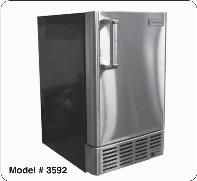
Model # 3592

INSTALLER: Leave these instructions with consumer. CONSUMER: Retain for future reference.